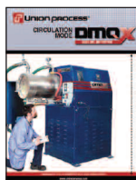
DMQX™ Bead Milling System