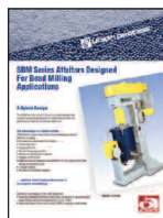
SDM Bead Mill

For information on our broad line of grinding and dispersing equipment, please visit our website at www.unionprocess.com .