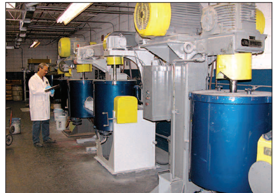
Toll processing utilizes the expertise of Union Process while saving the cost of a capital equipment investment.

After this initial testing phase, customers may purchase a mill or choose to have Union Process "toll mill" the material for them. Toll processing agreements may be for a short-term product development project or for long-term production. Toll processing saves customers the cost of capital equipment, personnel, space and other costs associated with on-site manufacturing.