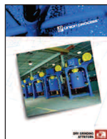
Dry Grinding Attritors